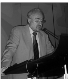
Mr. Michel Jarraud Secretary-General of the World Meteorological Organization

H.R.H. Princess Zahra Aga Khan, representing the Aga Khan Development Network, stated that the 2005 earthquake in Pakistan and northern India had made her realize that it was vital that communities living at risk be given the tools and technologies, the education and training to evaluate the safety of their own environment and to adapt this environment to implement disaster risk reduction objectives. Nevertheless, disaster risk reduction often faces man-made barriers such as administrative, political, cultural and legal constraints that hamper the development and change of social and structural systems in high-risk areas.