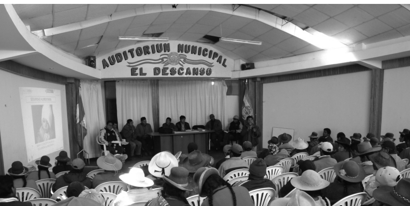
Peru. Meetings of local communities in the Andean highlands were organised by a consortium of NGOs to discuss climate change and measures to address water shortages.

Disaster risk reduction is embedded into the institutional framework for the national and local climate change policy. Under the new Act, a Climate Change Commission headed by the President of the Philippines will be created as the sole governmental policy-making body on climate change. Its primary function is to "ensure the mainstreaming of climate change, in synergy with disaster risk reduction, into national, sectoral and local development plans and programmes". The Act also gives local governments the primary responsibility for planning and implementing local climate change action plans, which will be consistent with national frameworks.