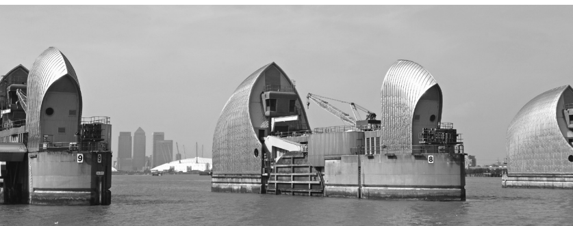
United Kingdom. The Thames Barrier, built in 1983, is a key element of the Thames tidal defence system and will play an important role in the London Climate Change Adaptation Strategy.

The Strategy is built on existing frameworks and programmes on risk. The most prominent part of the draft Strategy is the chapter on flood risk. The Strategy's analyses and proposed actions against flooding were based on the groundwork done with the city's partners in the context of disaster risk reduction. For instance, the Strategy's long-term tidal flood planning is based on a flood management study, the Thames Estuary 2100 Project, undertaken by the Environment Agency. Moreover, the Strategy's flood response and recovery planning finds its policy basis in the London Resilience Partnership, a consortium of national, regional and local agencies for emergency response in the region, and its London Flood Response Strategic Plan.