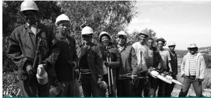
South Africa. Clearing invasive alien plants from waterways is part of Overstrand Municipality's comprehensive water management strategy, and has provided jobs and training to thousands of people.

In a recent study by reinsurance firm Munich Re, London was ranked the ninth most vulnerable major city to the impacts of climate change. Already in this decade, the capital endured floods in 2000, 2002, 2007 and 2008, droughts in 2006 and heat-waves in 2003 and 2006. The work on