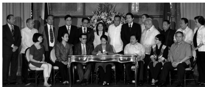
Philippines. Landmark legislation on climate change and disaster risk reduction was signed into law on 23 October 2009 by President Gloria Macapagal Arroyo, witnessed by Senator Loren B. Legarda, its author and sponsor, and Senate President Juan Ponce Enrile, Rizal Hall, Malacanang Palace.

The Forum aimed to promote the use of accumulated disaster risk reduction experience. While the two