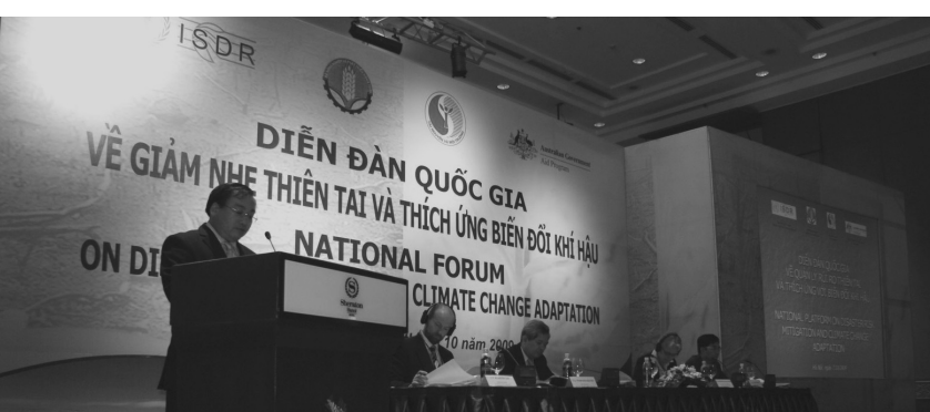
Viet Nam. Deputy Prime Minister Hoang Trung Hai opens the National Forum on Disaster Risk Reduction and Climate Change Adaptation, 7 October 2009, lending his support to efforts to deal with both issues jointly.

High-level political leadership helps overcome institutional barriers. The National Forum was hosted by the Deputy Prime Minister, whose leadership stressed national interest and collaboration between ministries. In Viet Nam, the Ministry of Natural Resources and the Environment is the lead agency for climate change coordination, while the Ministry of Agriculture and Rural Development maintains overall responsibility for rural development and disasters. A number of international organizations, such as the Australian Agency for International Development, UNDP, UNISDR, and the World Bank’s Global Facility for Disaster Reduction and Recovery played a role in supporting the Forum and assisting in the development of strengthened cross-sectoral cooperation and synergy.