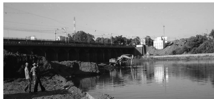
India. Dredging of the River Mutha was one of a number of risk reduction measures included in the city of Pune's comprehensive climate change plan.

The city of Pune in Maharashtra State, India, has a population of nearly 5 million people and is located at the confluence of the three rivers, Mutha, Mula and Pavana. It has been affected by several severe floods over the last six decades, the most significant being the 1961 flood that involved a major dam failure. Anticipating an increased frequency of floods owing to climate change,