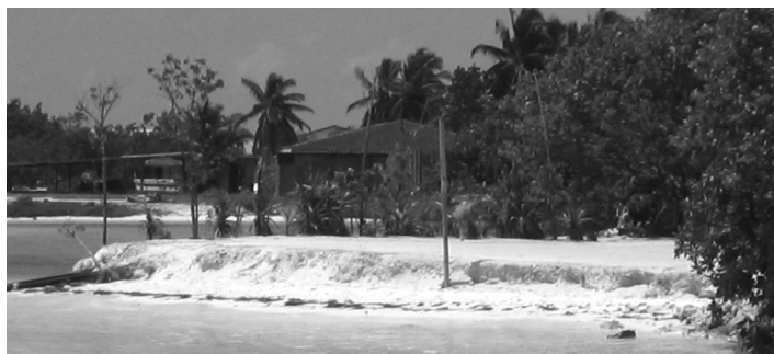
Maldives. Increased coastal erosion from climate change and sea level rise will be a key concern for the Strategic National Action Plan on disaster risk reduction and adaptation being developed by the government.

The Maldives is among the small island states identified as one of the most vulnerable to climate change impacts. Since the aftermath of the Indian Ocean tsunami, reducing disaster risks has become an important cross-cutting development issue in the island state. Against this background, the government has recently initiated a process to develop a Strategic National Action Plan (SNAP) on disaster risk reduction and climate change adaptation. It aims to promote collaboration